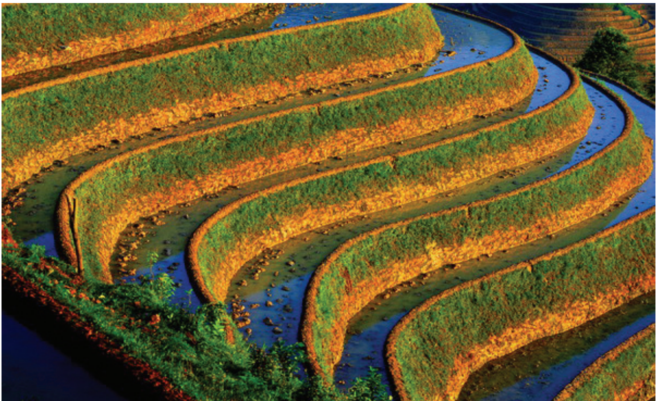
A traditional terraced paddy field in Guangxi Zhuang Autonomous Region

960,000 erosion gullies remain to be treated. It remains a pressing and enormous task to protect the black soil in Northeast China and salvage the land resources in regions suffering from stony desertification in Southwest China. Since the 1990s, over 15,000 km 2 of previously unaffected land has succumbed to soil and water erosion due to development activities with each passing year. The increased amount of soil loss has exceeded 300 million metric tons. The trend towards heightened erosion attributable to human activities has yet to be effectively arrested. The dynamics in the erosion control area falls far short of the country's overall objectives for ecological improvement and evolving towards a moderately better-off society.