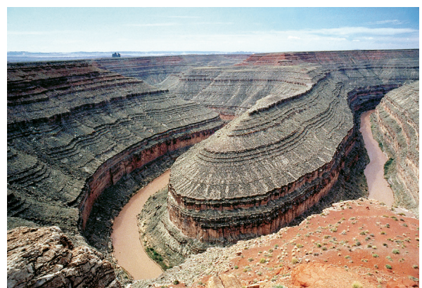
Turbid water resulted from soil erosion

Sedimentation worsens water supply-demand imbalance by impeding comprehensive development and effective utilization of water resources. In order to mitigate the loss to reservoir capacity associated with sediment deposition, some reservoirs along the trunk stream and tributaries of the Yellow River have to adopt the operation mode of releasing sediments by emptying the reservoir. Large amounts of precious water resources are discharged along with sediments. Every year, 20 billion m 3 or so of water is needed to carry the sediment flux in the lower reaches of the Yellow River into the sea in order to lower the river bed. While simultaneously carrying sediments in large quantities, soil and water erosion, as a carrier of non-point source pollution, also releases into the water body massive amounts of hazardous substances including fertilizer, pesticides and household garbage. This poses a grave threat to drinking water safety.