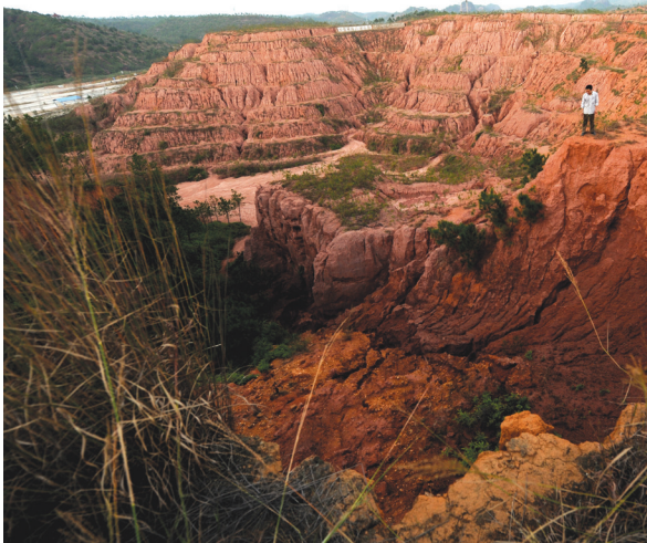
Soil erosion in Ganzhou City, Jiangxi Province

lost 3 million-plus ha of arable land due to soil and water erosion, averaging 60,000-odd ha per year. The part of the Loess Plateau that is affected most by soil and water erosion has lost more than 1 cm of surface soil each year. In some parts of the black soil northeast region, the thickness of farming layer has dropped below 20 cm, down from 1 m or so at the very beginning of reclamation. Up to 77% of the earth-rock regions in North China has a soil layer thickness of less than 30 cm. The ratios are 42.1% and 18.8% respectively in the karst area in Southwest China, the upper and middle reaches of the Yangtze River and various rivers in Southwest China.