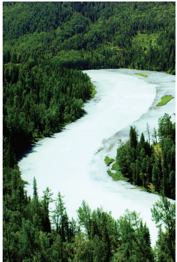
Forest for soil and water conservation in Xinjiang Uygur Autonomous Region

Since the official enactment of the Law of the People's Republic of China on Water and Soil Conservation in 1991, China has evolved towards a rule-of-law approach to water and soil conservation. Under a mandatory regime governing construction projects, soil and water conservation facilities must be designed, constructed and put into operation in parallel with the corresponding phases of the underlying development project. This approach has made a remarkable difference. Soil and water conservation plans are developed for upwards of 90% of the country's large and medium-sized development projects. Project developers and owners helped prevent and control over 100,000 km 2 of land vulnerable to soil and water erosion. 2.24 billion metric tons of soil erosion was avoided. In 2011, the amended Law on Water and Soil Conservation went into effect. The law gave more teeth to the provisions on government accountability, the legal status of planning, prevention and control policies, and legal liability. Governments at all levels have taken concrete steps to increase oversight and enforcement over soil and water conservation. Man-made soil and water erosion is subject to draconian regulation. The general public has become significantly more aware of the legal obligation for soil and water conservation.