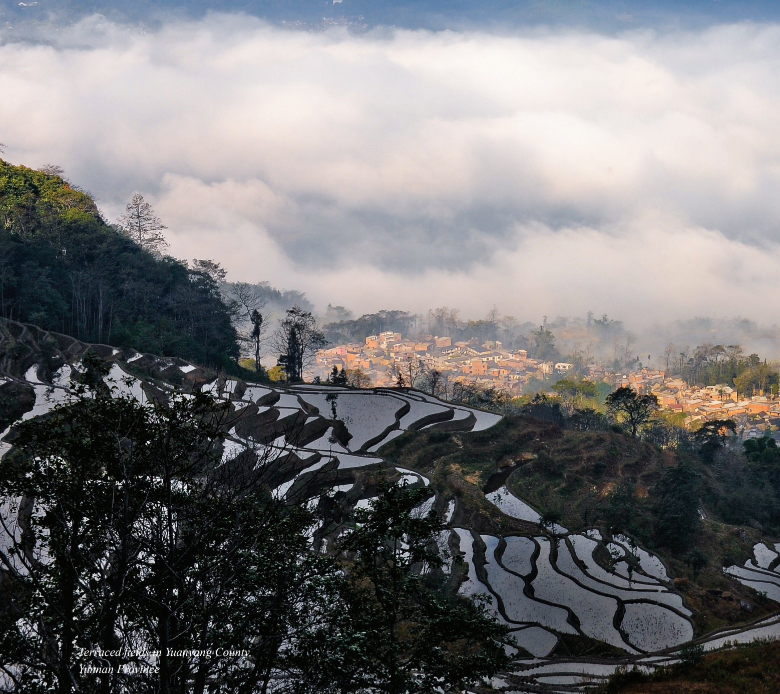
Terraced fields in Yuanyang County, Yunnan Province