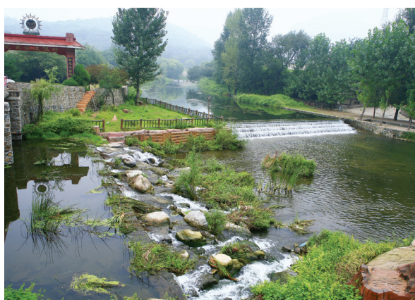
Shentangyu Small Watershed Landscape Project in Huairou of Beijing City

In recent years, places around the country have succeeded in blazing a new trail in managing small watersheds with locally relevant solutions. Under this approach, soil and water erosion is managed alongside sewage, rubbish, toilets, the environment and river channels in water source protection zones and the surrounding areas of cities. Three lines of defense, namely, ecological rehabilitation, ecological improvement and ecological protection, are put in place under this mode of developing small ecologically