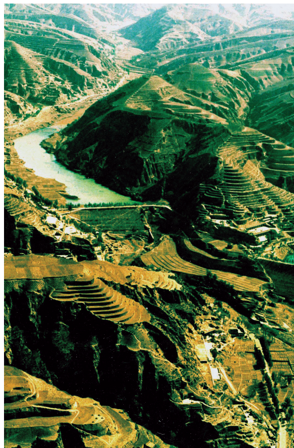
Silt retention dam built in Jiuyuangou River Basin in Shaanxi Province

implemented so as to pursue preventative protection in areas that enjoy sound vegetation and are ecologically fragile, to scrutinize areas that are subject to intensive exploitation of energy and resources.