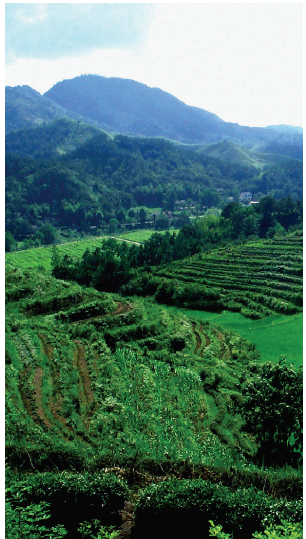
Small Watershed Restoration Project in Anhui Province

Since the turn of the century, China has embraced a shift in its approach to soil and water conservation. In addition to stepped-up efforts on comprehensive control over erosion, China has resorted to mountain closure for afforestation, grazing prohibition and rotation grazing. The autonomous rehabilitation capacity of nature is brought into full play. Efforts are made to speed up vegetation recovery, reduce soil and water erosion and improve the eco-environment. The Ministry of Water Resources has launched two